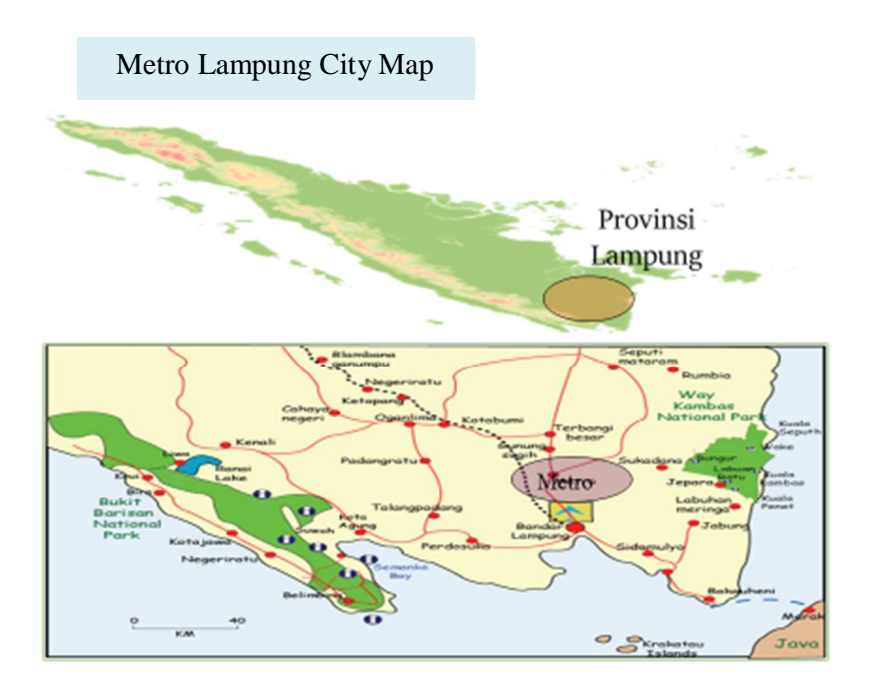
Fig. 1.1 Metro Lampung city map

Metro city is one of the cities in Lampung province. It is located around 45 km from the Capital City of Bandar Lampung. Metro city is the largest banana producer in Lampung province that produces 6,521 tons of production per year. The majority of people rely on agriculture and other supporting sectors such as the public sector, trade, transport and communications and construction. Metro City is divided into five regions namely Metro West, Metro Center, South Metro, Metro East and Metro North. Metro Lampung city geographical position is reflected in Figure 1.1.