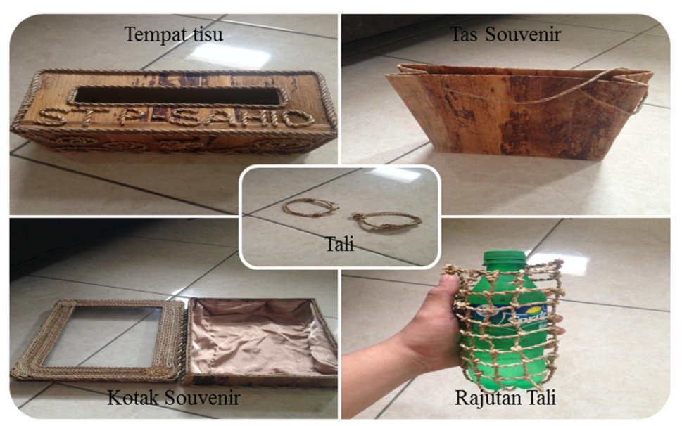
Fig 4.2 Handcrafts made from banana fronds

The results of field observation record that many groups of women farmers produces processed bananas and their derivative products such as banana chips with different flavors, egg roll, banana flour, syrup, banana cake, banana cookies, crackers, and others. The products are mass produced and often abundant in terms of numbers. The products sold in several local shops with poor accessibility. This has become a basis in identifying the potential of Metro Lampung particular culinary tourism. Utilization of bananas provide added value to the city. Currently there are only processed banana chips but because of the hard work, creativity and initiative of the women farmer groups under the guidance of the Ministry of Agriculture, the bananas are processed into a variety of products. Even other parts of plants such as banana fronds, leaves, and stems can be utilized as handcrafts. Crafts include towels, gift bags, gift boxes, and knitted rope for a bottle of syrup as in figure 4.2 below.