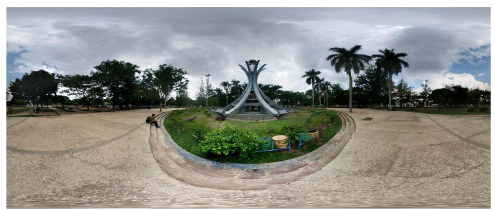
Fig 4.1 Metro Lampung City Park

Lifestyle trends supported by increased living standard generate tourism activities. Metro Lampung city, which is the object of this research, has the potential to be one of the culinary tourism destinations. There are three major points outlined in this part. They are: culinary tourism in Metro Lampung city, culinary tourism development strategy, and identification of the factors that can support the local culinary to be tourist attraction in Metro Lampung city. In addition to the three points of discussion, some places that are strategic in supporting local culinary central is recommended as shown in figure 4.1 below.